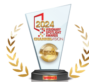
VSA MOST RESPONSIVE SUPPLIER CHANNEL TEAM OF THE YEAR 2023_2024