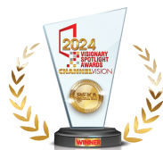
VSA MULTI-LOCATION DEPLOYMENTS OF THE YEAR 2024