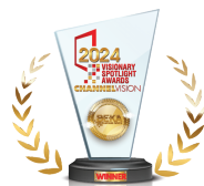
VSA CHANNEL PROGRAM OF THE YEAR 2023_2024

For over 30 years, SolEx has been providing top-tier forward-thinking solutions to enterprise clients via its 100% partner-based distribution channel. With a portfolio consisting of Voice & Collaboration, Data & Networking, and Security & SASE, which spans simple POTS Replacement to Low Earth Orbit Satellite and Secure Access Service Edge, SolEx excels in delivering boutique complex multi-location, multi-vendor meshed solutions and customized billing that others find difficult to achieve. Use us when your needs are complex, and you need stellar reliability. As an award-winning customer focused technology-centric private enterprise serving some of the biggest and most prestigious companies in the USA and around the globe, we turn aspirations into positive tangible business outcomes.